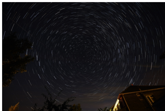
Polar Star Trails

We'll be launching our Calendar competition toward the end of September so keep an eye out for the details soon, remember entries can be old or new, imaged via ccd or drawn by hand. The image must be your own work.