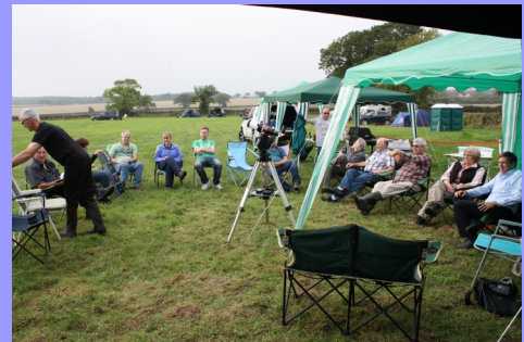
2014 Star Party

On Friday 30 Sep – Sunday 2 Oct Bromsgrove Astronomical Society are having their second society Star Party. Hosted at Woodside Country Park in Ledbury, Herefordshire ( woodsidelodges.co.uk ) this is a great opportunity to spend a couple of nights under the stars with society members learning and sharing memories. Members are to book directly with Woodside. There are a few electric hook up and non-electric pitches remaining on the Cider Mill field. We will be issuing detailed Star Party guidelines shortly, if you have already booked let us know on the society forum.