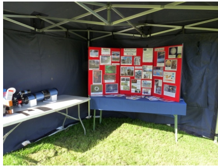
Setting up for Avoncroft Camping Night.